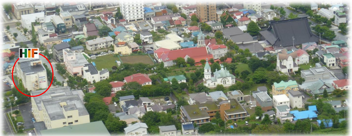
View from Mt. Hakodate

HOKKAIDO INTERNATIONAL FOUNDATION (HIF) • 14-1 MOTOMACHI, HAKODATE, HOKKAIDO 040-0054 JAPAN (P) 0138-22-0770 • (F) 0138-22-0660 • jj@hif.or.jp • http://www.hif.or.jp/en/summer/